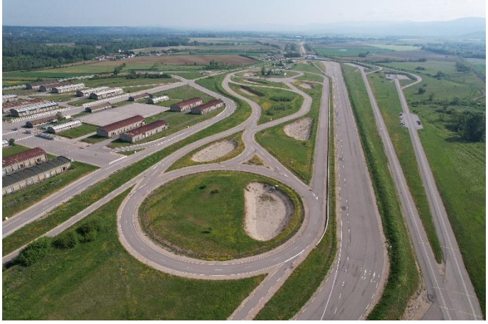
Drone photo of Transpolis test center located in Lyon region (FR)